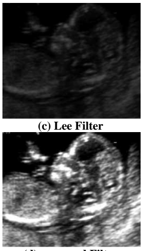
(d) proposed Filter